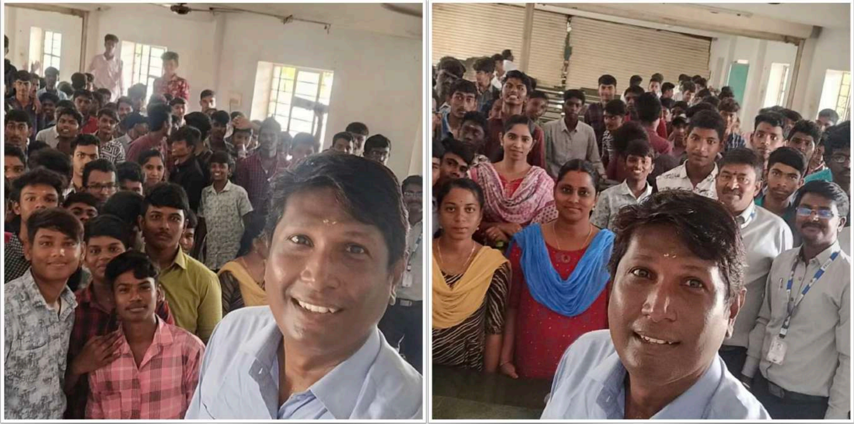
As a Motivational speaker interacting with students at Smt. Rajammal Rangasamy Industrial Training Institute, Tiruchengode.