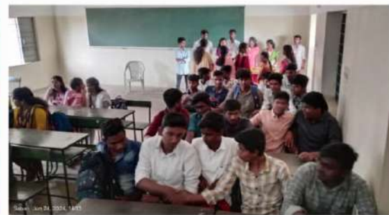
iGene Association has organized an event to welcome the Juniors on their first day of college.