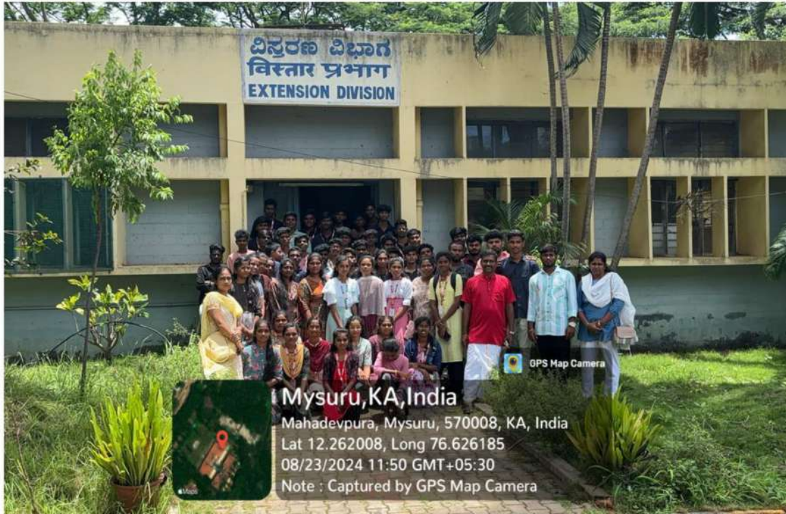
Field Visit to CSRTI, Mysore on 23.8.2024 for the II.B.Sc., and I M.Sc., Students and Miyawaki Forest, Bangalore on 24.8.2024.