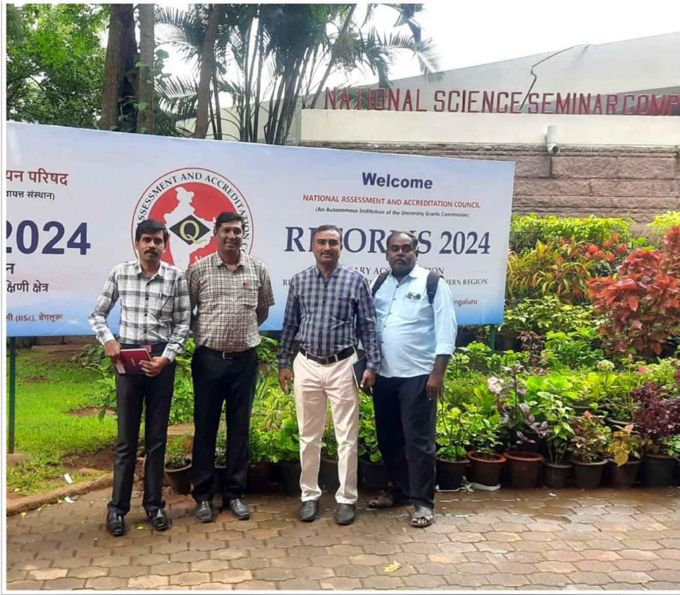
NAAC Reforms Consultative Workshop at Indian Institute of Science, Bangalore on 16 th July 2024.