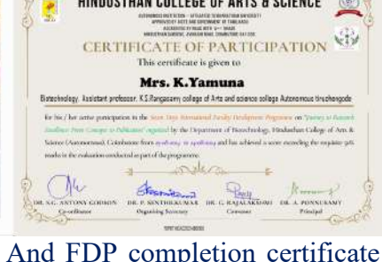
Faculty Development Program conducted by R&D Cell, KSRCAS(A) on 13 th August 2024. And FDP completion certificate from Hindusthan College of Arts and Science from 19 th Aug to 24 th Aug, 2024.