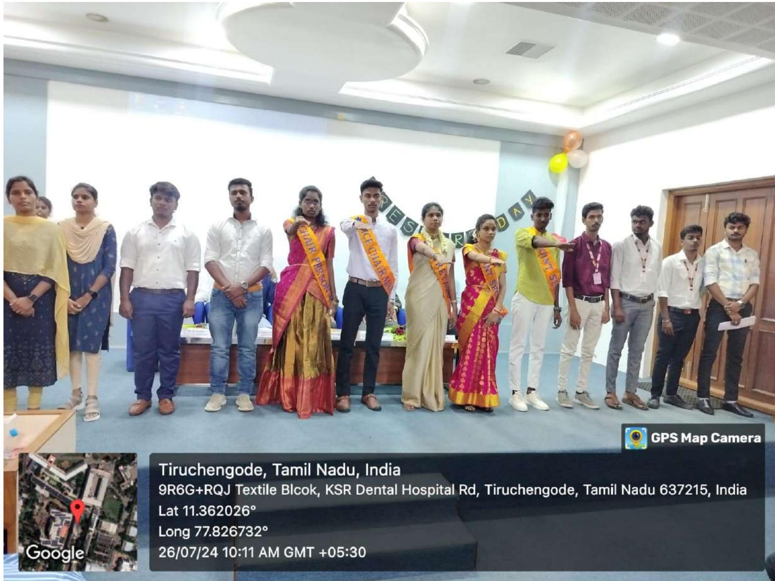
Science Club, Idea and Innovation Club have been inaugurated and their representatives were also appointed and they took the pledge.